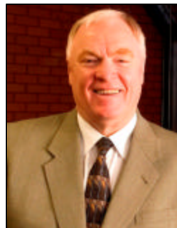
Donald Ching, C.E.O. AREVA - COGEMA Resources Inc. Uranium Panelist